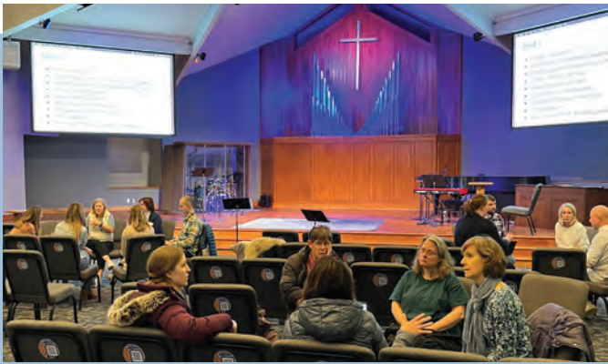
The AACS Association was invited to brainstorming meetings that laid out the five strategic areas that the school's leadership is considering.

What does the word “strategic” mean to you? There might be some variations on the definition between different sectors (e.g., corporate world vs education world), but I think everyone would agree that it refers to long-term goals and aspirations that are meant to advance the mission and core values of an organization. They are not small, operational tasks, but higher-level objectives that drive the daily, weekly, and monthly decisions.