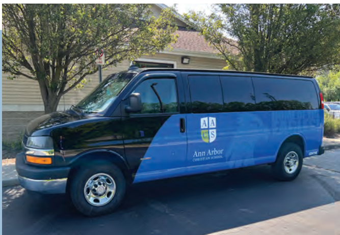
Thanks to a generous donation, AACS has its first transportation vehicle! This passenger van will transport high school students from our main campus to the high school campus, take teams to athletic events, and help the entire school with other school activities, such as field trips.

As you read this Beacon, the school year has ended, summer has begun, and a new chapter awaits in a couple short months.