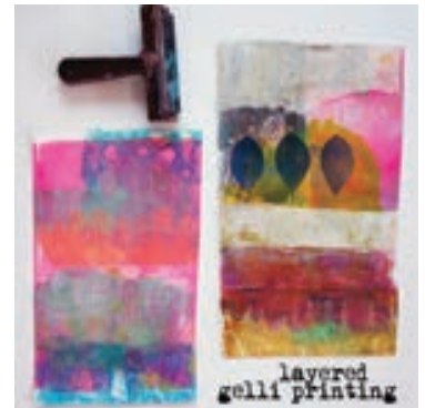
layered gelli printing