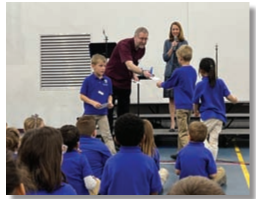
Our AACS students receiving their seed money during their commissioning on Grandparents' Day.

Please pray for our students as they learn about the purpose that God has for each of them.