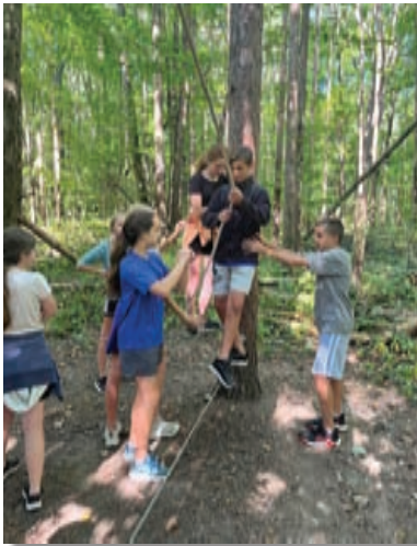
Our 8th graders at their leadership retreat.