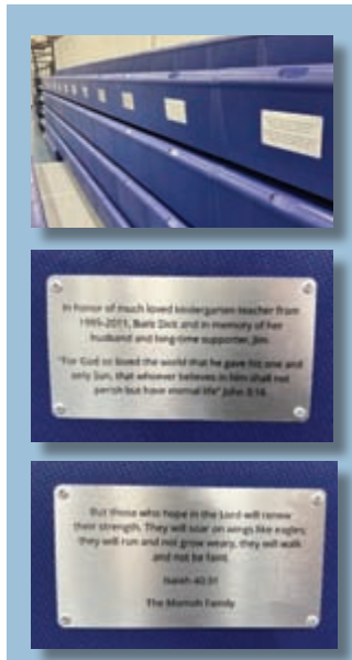
Thank you to those who also donated bleacher plaques—they are a daily reminder of God’s impact on our lives and the legacy you have left to AACCS.

If He can do the impossible task of feeding 5000 people with a few pieces of fish and bread, then we can truly believe that He can finish the multiplying work He has started with our second campus. We can trust He has so much in store for Ann Arbor Christian’s future beyond our best laid plans.