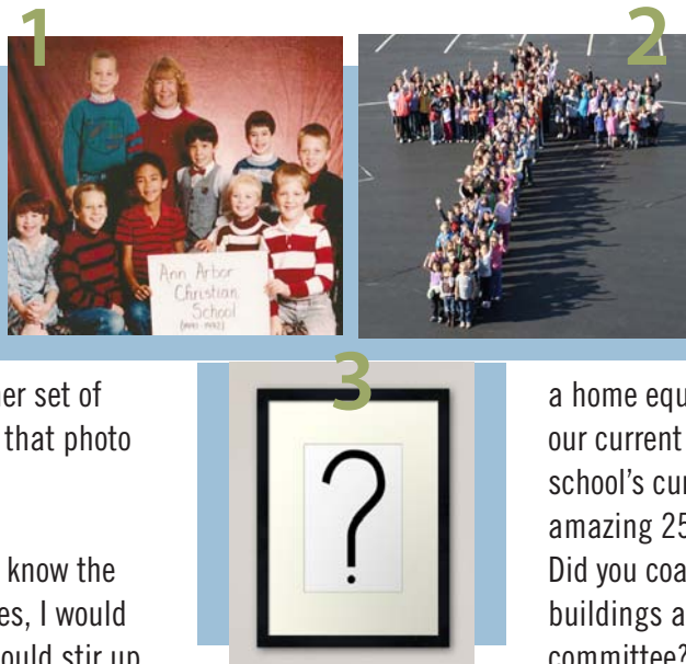
Image one: founding class of AACS in year one. Image two: cross image made with students of AACS taken in our 20th year. Image three: how can God use you?

To think that what you did then not only served the school at that moment but now also blesses the current generation of families and staff. To think that what you do now strengthens AACS beyond the current families who attend and is planting seeds for what AACS will look like in its future.