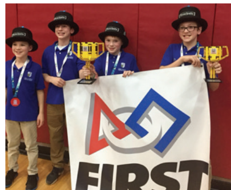
AACCS Robotics Team after their Michigan State Championship win at The FIRST Lego League (FLL) Robotics Competition.