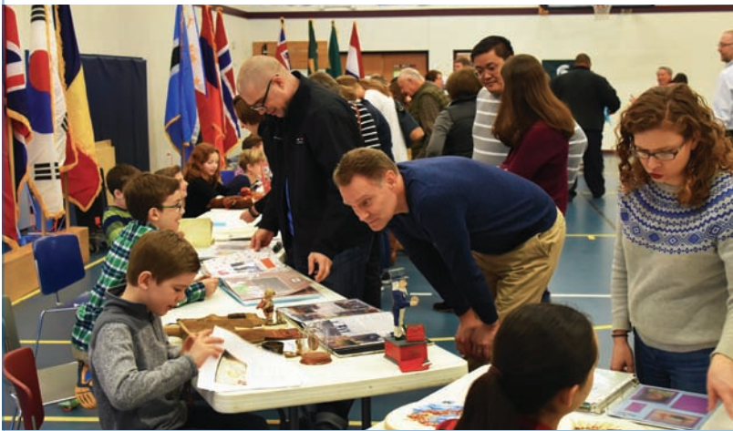
The Ann Arbor Christian School community supporting fifth graders as they present their family heritage projects.

A few years ago, I wrote about how I am always moved by a child's baptism. The pastor reminds the parents of their irreplaceable role and duty to raise their child in God's ways. Then, before an assembled body of believers, the parents profess their intention faithfully to ask for God's help to do their best. Then, the pastor turns to the congregation and speaks to everyone witnessing the event. The pastor is well-aware that some in the pews may never meet this child or family, but there is nevertheless a challenge and duty put before everyone to spur on that family's faith in the Lord and to let every opportunity presented be an encouragement for that child's faith.