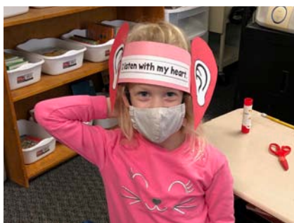
Elementary students worked on their “listening with my heart” hats to help them connect that, when we listen, we need to engage more than just our ears, but also our hearts to truly understand and “hear” people as God does.