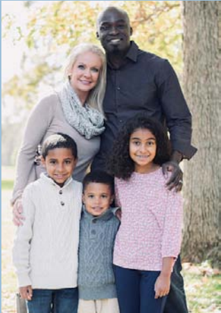
We've been at AACPS now for 6 years! This school encourages the academic and spiritual growth of our children. We have always been so thankful for the teachers and staff, but this year even more so! They have provided a safe learning environment which allowed our kids to be back for in-person learning. We will be forever grateful for the sacrifices and effort the school leadership, teachers, and staff have and continue to make in this challenging year.