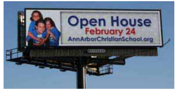
New AACCS Advertising