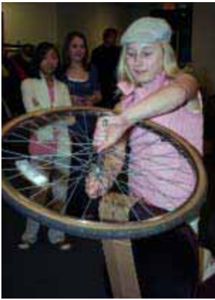
Science Fair Gyroscope