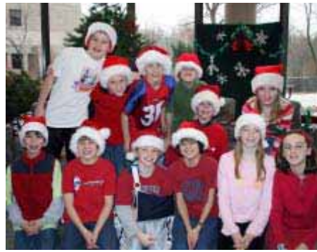
Fifth Graders volunteer at Huron Woods