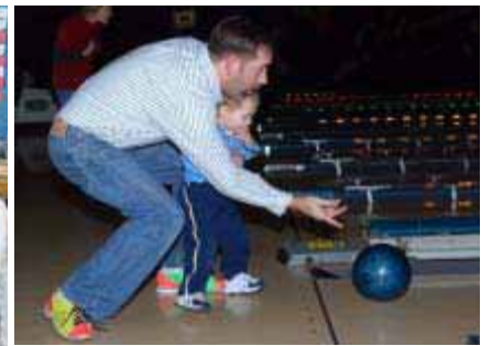
Community Building Bowling

The AACCS teachers have completed their grade level curriculum guides for current and prospective families. You can see them on the AACCS website. Tell your friends about the great Christ-centered education that your children have received/are receiving here and then send them to the website to read for themselves.