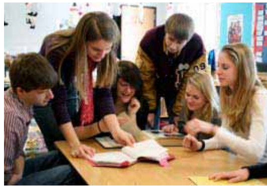
Alumni Connect after MLK Chapel